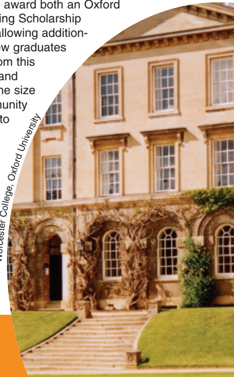
Worcester College, Oxford University

This year, the leaderships of the Scholarship and of the Class of 1960 are undertaking a capital campaign to secure the financial support of the Class in perpetuity and the Scholarship's long-term financial health. Given the exceptional quality of the applicants, we also hope to fulfill a longstanding ambition: to give the selection committees the ability to award both an Oxford and a traveling Scholarship each year, allowing additional worthy new graduates to benefit from this experience and increasing the size of the community of Scholars to support the program in the future.